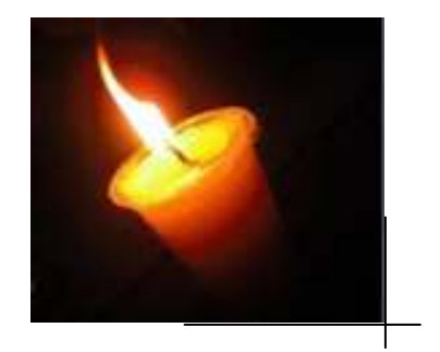
At the beginning it was joy. In the middle it is joy. At the end there will be only joy